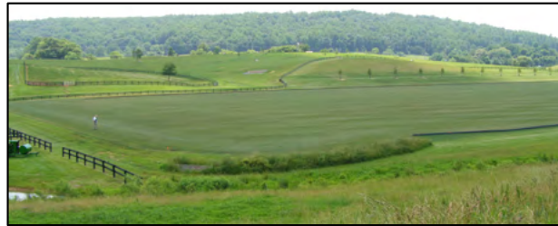
(Top): Montana Tall Fescue on the new polo fields at the Equestrian Center at Great Meadows in The Plains, VA.