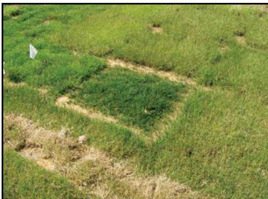
In unirrigated test plots on a sod farm in northern VA, Frontier survives an extended drought which occurred from the date that the plots were planted on Sept. 6 until mid Nov. This photo taken on June 3, 2008 shows that most of the other perennial ryegrasses being tested succumbed to this stress but not Frontier which still looked great.