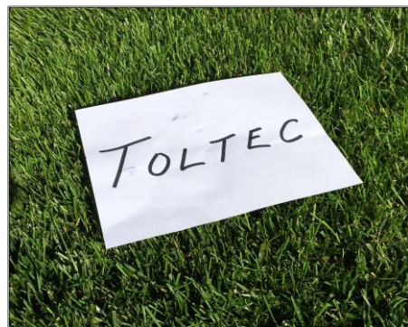
(Above): Toltec's dark-green color and thick density are seen against a white paper background on a test plot in Corvallis, Oregon.